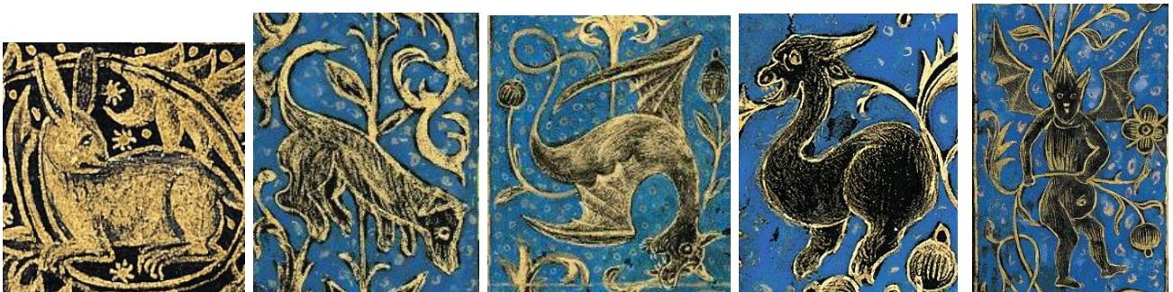
Various animals and a Demon

For the look of the Morgan Black Hours, fill in anything not to remain black with blue. Finally, edge and highlight the sketches with either gold, as seen in most of the clips above, or paint in polychrome as in the Sforza Black Hours. For color ideas, there are links to the digitized copies of both the Morgan Hours and Sforza Hours below.