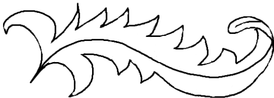
Acanthus without Shading

The inks used for the calligraphy were gold and silver, to stand out against the black ground. The paints are usually a limited palette of blue, white, gold, old rose, flesh tone, chartreuse, and grey. Some extant examples are very simple like the Morgan Black Hours, using only blue, white and gold, while the Sforza Black Hours shows a wide variety of colors. In fact, the Hours of the Blessed Mary are executed in only gold on the black ground, which is striking in its simplistic beauty.