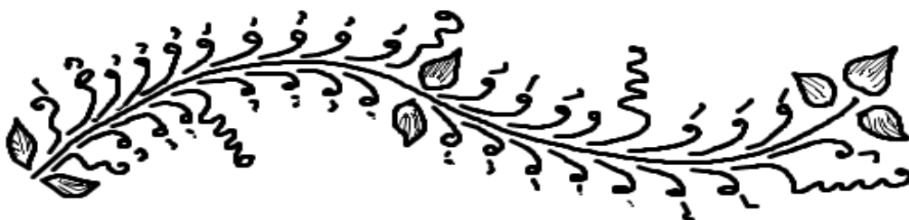
Example of Vine Work

As with most examples of illumination from the 15 th c., the acanthus leaf is the most prominent factor of the illumination with additions of vines, fruit, animals and heraldry as the pieces get more complex. Because the ground is black, the shading of each item is done in reverse, leaving the darkest parts plain black and sketching in lines to brighten where needed. This reverse shading is seen on all the pieces and takes a little practice.