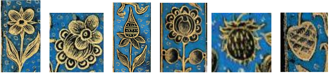
Various Flowers and Plants