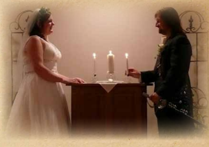
Honeymoon in Paris!

These are on display at Musee National du Moyen Age, Paris