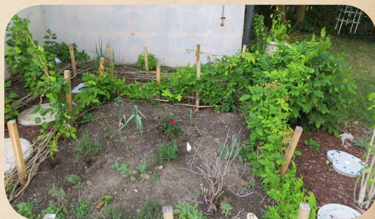
Training Wisteria to be a living hedge