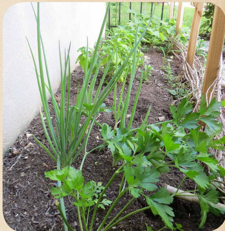
Parsley, Green onions, basil and beans