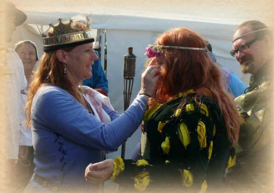
With help from Their Royal Magesties