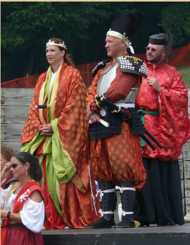
Their Majesties at Opening Ceremonies Photo credit: Dragos Pelikanos 2011