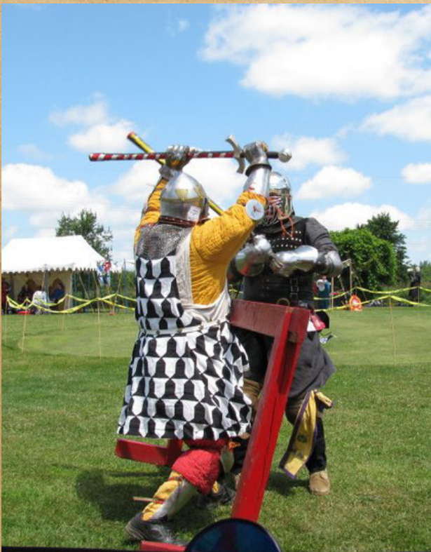
Earl Sir Yngvar the Dismal and Lord Gwydion of Arden