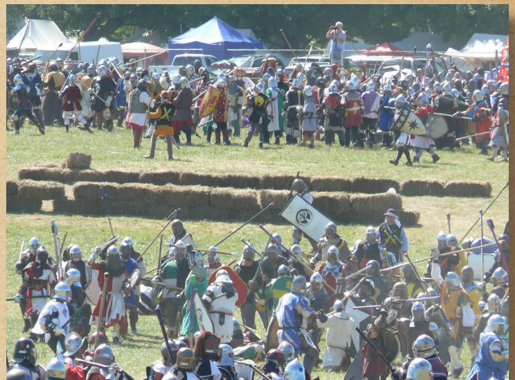
Bridge Battle Photo credit: Dragos Pelikanos 2011