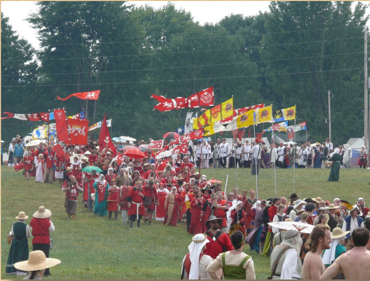
Opening Ceremonies