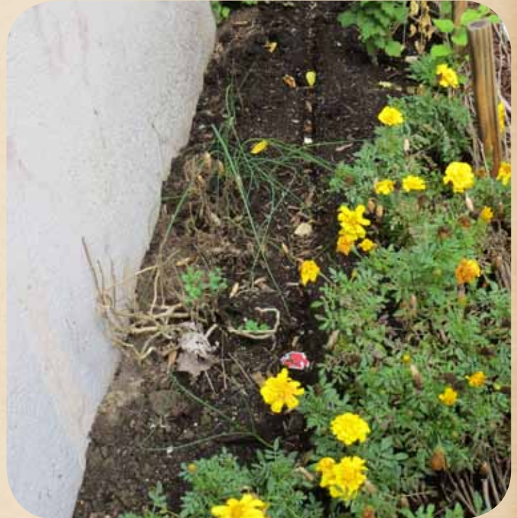
Marigolds, rue, and chives