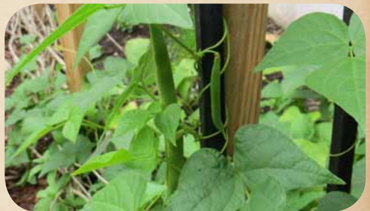
Beans finally grew!