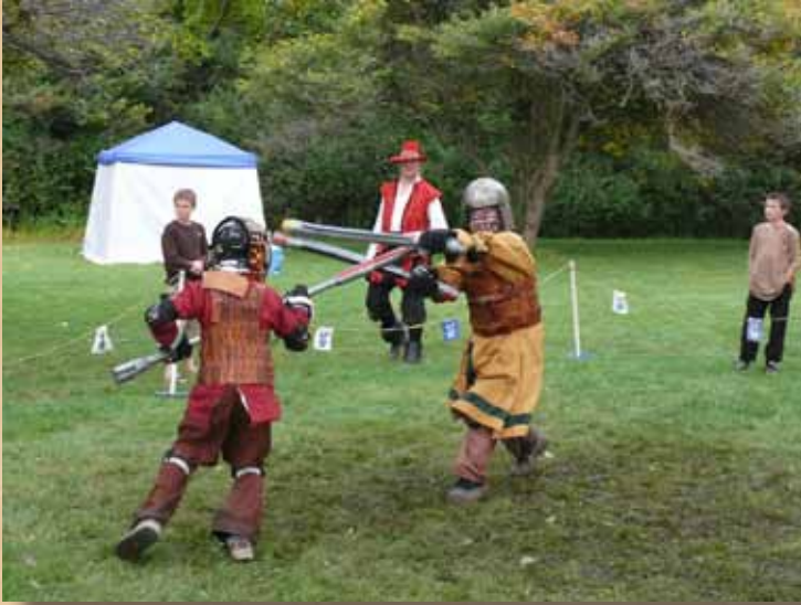
Youth Fighting