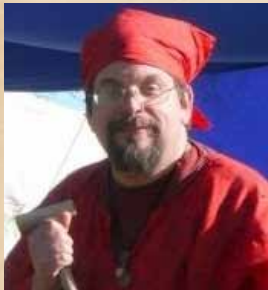
Dragos Pelikanos Order of the Windmill