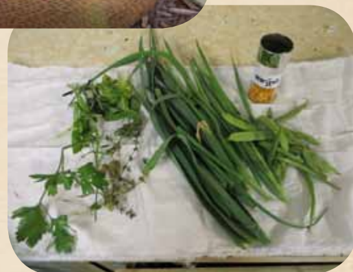
Ingredients for my gode broth, all from my garden!