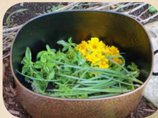
My small, but exciting harvest