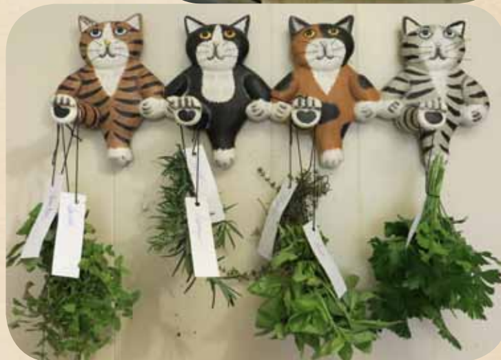
Herbs labeled and hung to dry