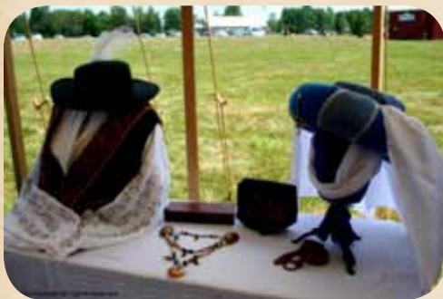
A&S Display