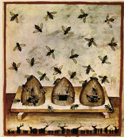
From Tacuino Sanitatis 13th Century