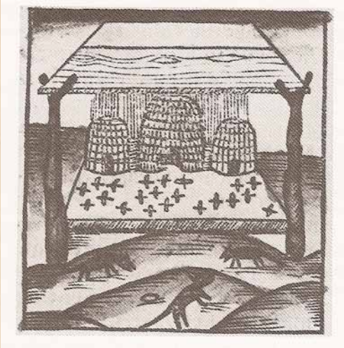
Bees flying from three skeps in a simple shelter with mice in the foreground. Buch der Natur, 1475