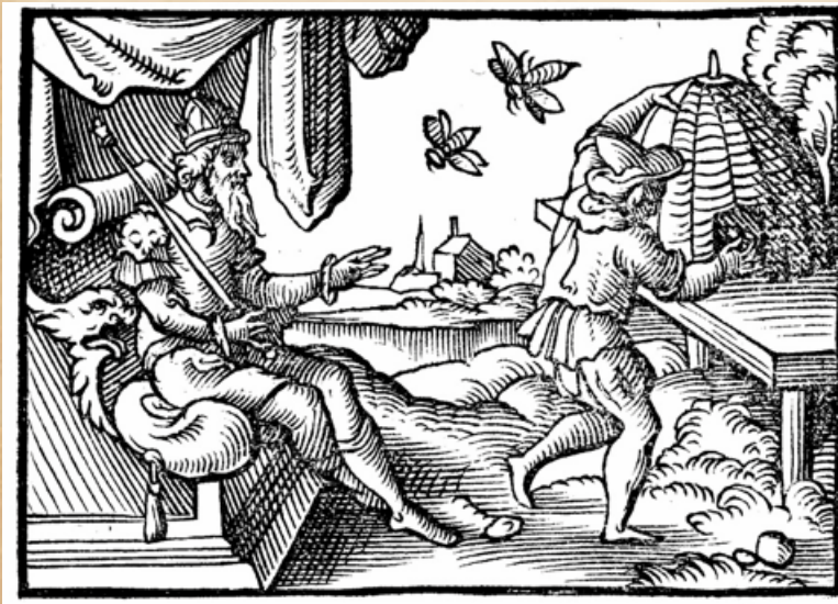
From the book of Aesop fables published in Frankfurt in 1566, art by Virgil Solis