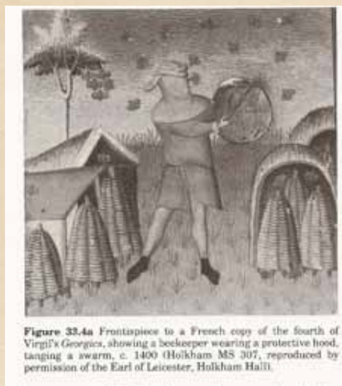
Figure 33.4a Frontispiece to a French copy of the fourth of Virgil's Georgics , showing a beekeeper wearing a protective hood, tending a swarm, c. 1400 (Holkham MS 307, reproduced by permission of the Earl of Leicester, Holkham Hall).

Beekeepers watched for swarms. This would involve a lot of time and implies that swarm beekeeping was for career beekeepers. The