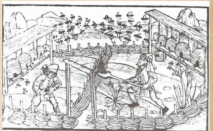
Woodcut by Johann Grüniger showing straw skeps in two simple bee shelters. 1502