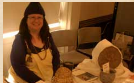
Baroness Olivia d'Anjou Companion of the Order of the Windmill