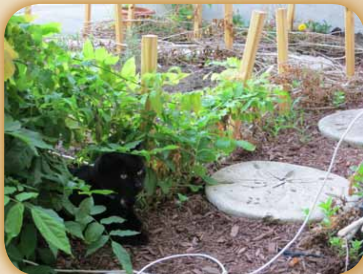
Pest-control device hard at work (or hardly working)