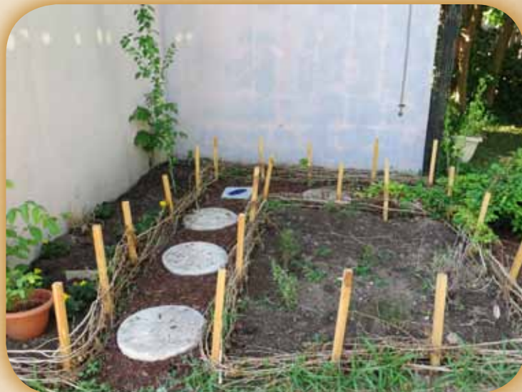
The garden planted and starting to germinate