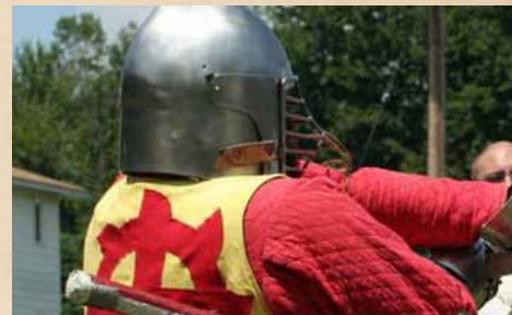
Lord Fridrich Flußmüllner Baronial Heavy Weapons Champion