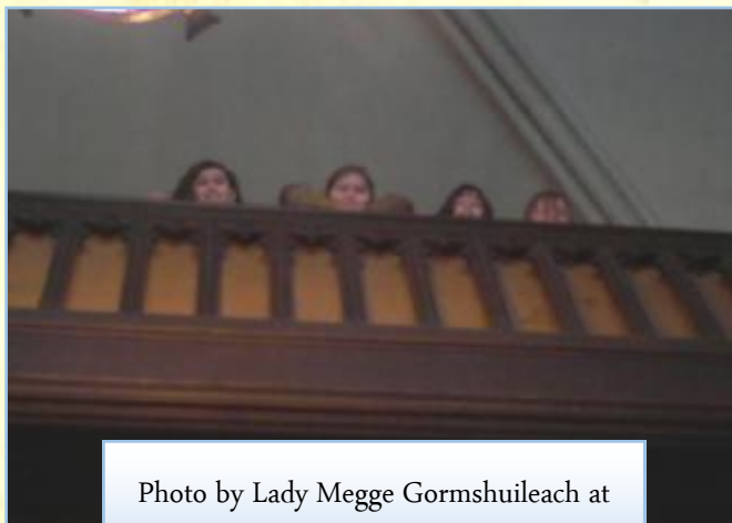
at the Feast of the Seven Deadly Sins

Meeting closed by Sir Yngvar at 7:58 PM.