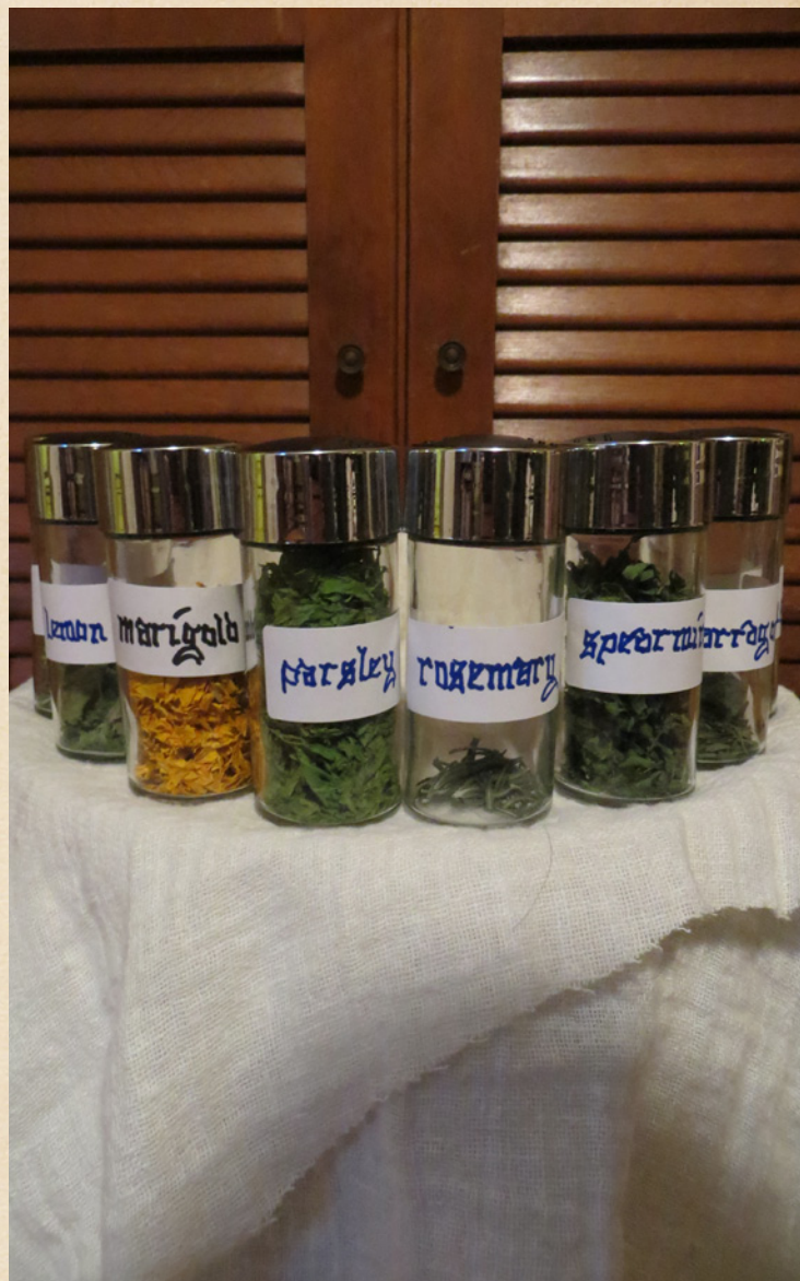
The harvested herbs dried and in jars